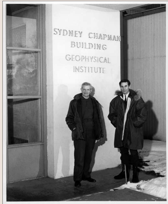
Figure 1: Sydney Chapman and son Cecil, at the Fairbanks Geophysical Institute at the University of Alaska building named in his honor in 1968.

The first IPY occurred at a time of considerable sunspot activity, offering a unique opportunity to observe its effects around the circumpolar world. Although the IPY sites were established with some difficulty, all of the stations maintained operations to about the same time in early August 1883. This provided an excellent composite baseline record of various geophysical variables. Shortly after the conclusion of IPY field activities, Krakatoa erupted on 26–27 August 1883, sending atmospheric waves twice around the Earth and setting up immense pyroclastic flows and tsunamis. The finest fragments of tephra resulted in acidic aerosols and volcanic dust, which traveled around the world, generating exotic optical effects for several years, including a temperature drop of several degrees. Thus the fulfillment of Karl Weyprecht's vision established the value of international cooperation in geophysical observations. Although 12 nations agreed to Weyprecht's grand idea of collaboration,